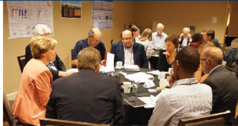
Participants at an HEI Energy Research Planning Workshop