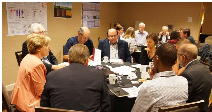
Participants at an HEI Energy Exposure Workshop

The success of the effort depends strongly on cooperation among government, industry, and other stakeholders to create an environment of trust in which literature reviews and research can be relied on to support sound decision making.