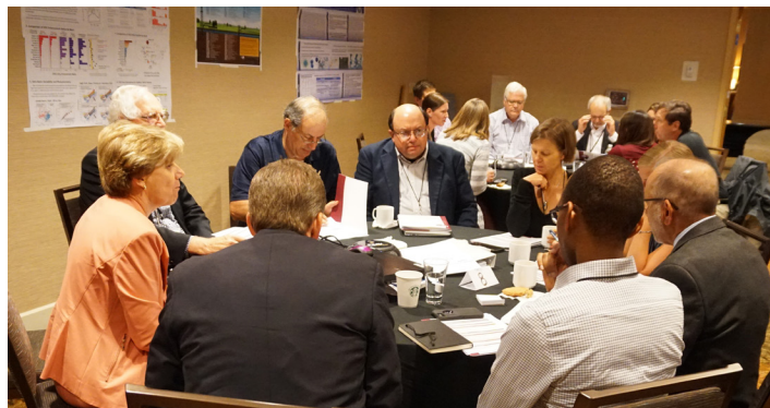
Participants at an HEI-Energy Exposure Workshop

The success of the effort depends strongly on cooperation among government, industry, and other stakeholders to create an environment of trust in which literature reviews and research can be relied on to support sound decision making.